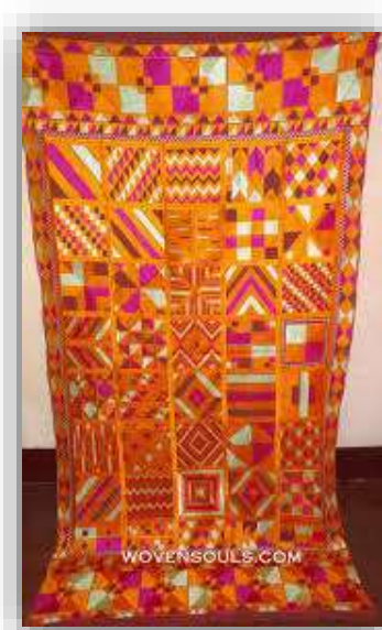
Figure6: A Phulkari

Surface embroidery techniques such as chain stitch and couching or laid-work are the most economical of expensive yarns; couching is generally used for goldwork. Canvas work techniques, in which large amounts of yarn are buried on the back of the work, use more materials but provide a sturdier and more substantial finished textile.