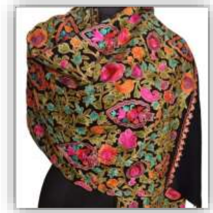
Figure5: Kashmiri embroidery

The craftsmen use shades that blend with the background. Thread colors are inspired by local flowers. Only one or two stitches are employed on one fabric. Kashmiri embroidery is known for the skilled execution of a single stitch, which is often called the Kashmiri stitch and which may comprise the chain stitch, the satin stitch, the slanted darn stitch, the stem stitch, and the herringbone stitch. Sometimes, the doori (knot) stitches are used but not more than one or two at a time.