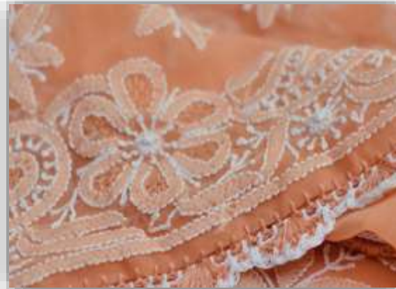
Figure3: Chikan embroidery