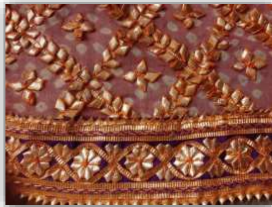
Figure4: Gota-Kinari embroidery

It is a form of appliqué in gold thread, used for women's formal attire. Small pieces of zari ribbon are applied onto the fabric with the edges sewn down to create elaborate patterns. Lengths of wider golden ribbons are stitched on the edges of the fabric to create an effect of gold zari work. Khandela in Shekhawati is famous for its manufacture. The Muslim community uses Kinari or edging, a fringed border decoration. Gota-kinari practiced mainly in Jaipur , utilising fine shapes of bird, animals, human figures which are cut and sewn on to the material.