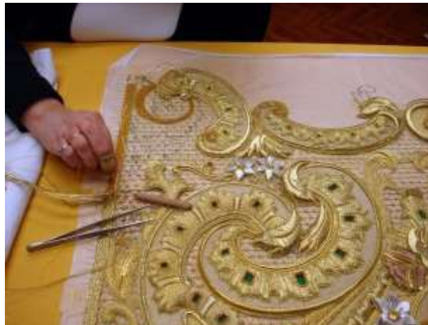
Figure 1. : Glimpes of Hand Work

Depending on time, location and materials available, embroidery could be the domain of a few experts or a widespread, popular technique. This flexibility led to a variety of works, from the royal to the mundane. Elaborately embroidered clothing, religious objects, and household items often were seen as a mark of wealth and status, as in the case of Opus Anglicanum, a technique used by professional workshops and guilds in medieval England. In 18th-century England and its colonies, samplers employing fine silks were produced by the daughters of wealthy families. Embroidery was a skill marking a girl's path into womanhood as well as conveying rank and social standing. Conversely, embroidery is also a folk art, using materials that were accessible to nonprofessionals. Examples include Hardanger from Norway, Merezhka from Ukraine, Mountmellick embroidery from Ireland, Nakshi kantha from Bangladesh and West Bengal, and Brazilian embroidery. Many techniques had a practical use such as Sashiko from Japan, which was used as a way to reinforce clothing.